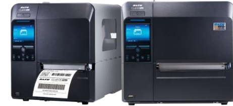
CL4NX Plus CL6NX Plus